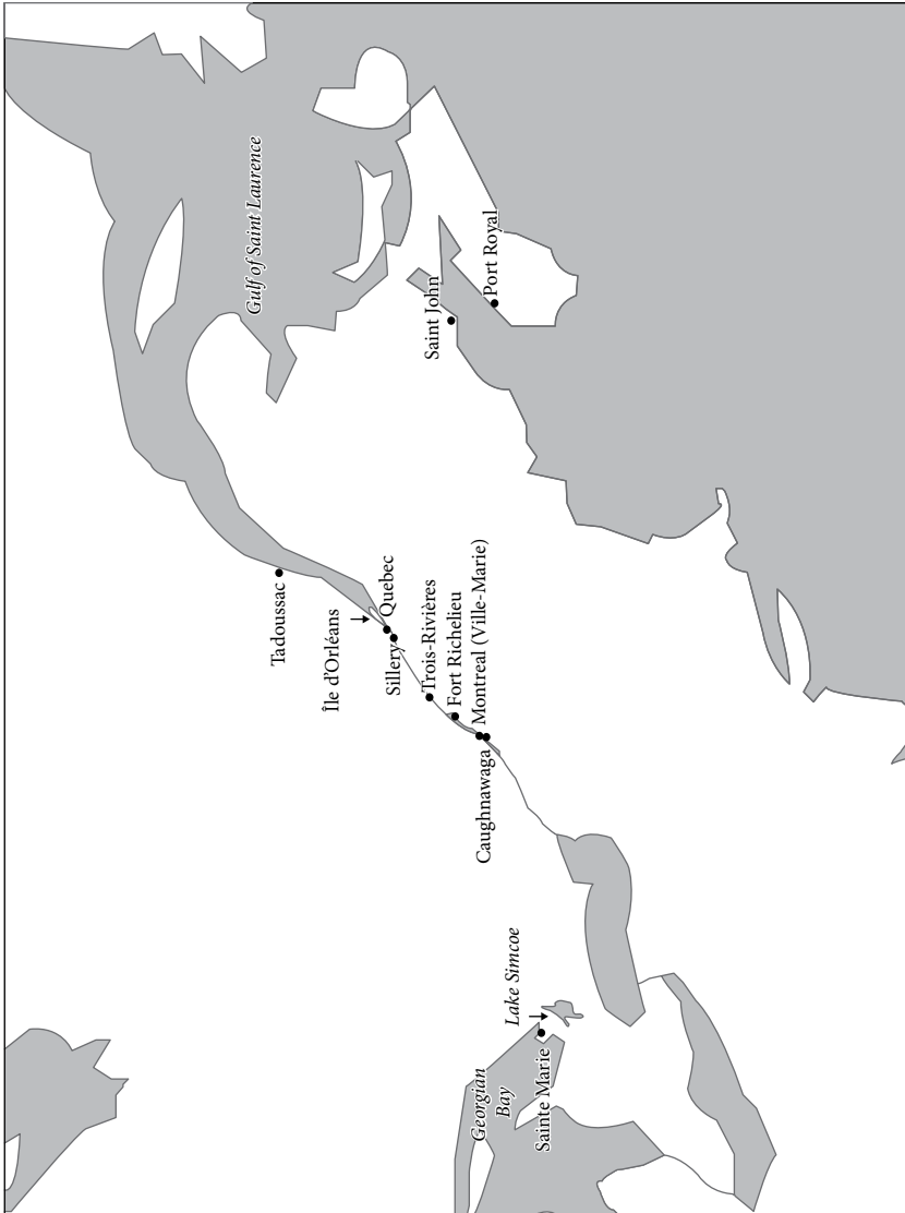
3. Map of New France