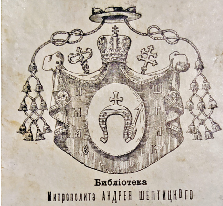
FIGURE 7.2 Ex libris: Byblioteka Mytropolyta Andrey Sheptytskoho LIBRARY OF METROPOLITAN ANDREY SHEPTYTSKY