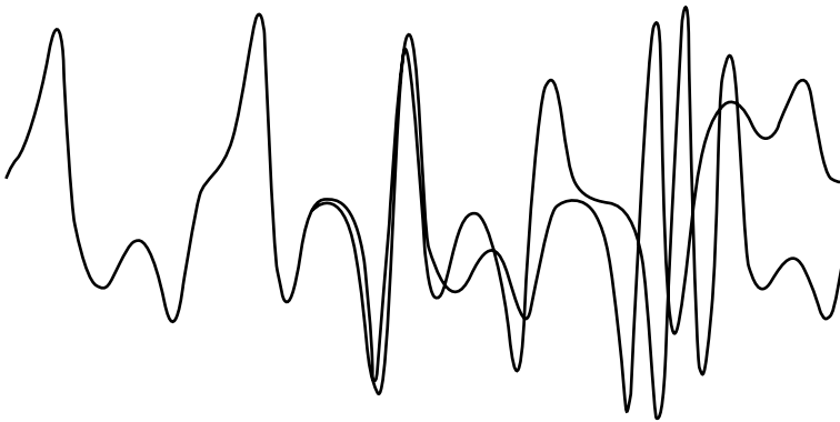
FIGURE 17.2 Plots of the data from two simulations of weather response over time.