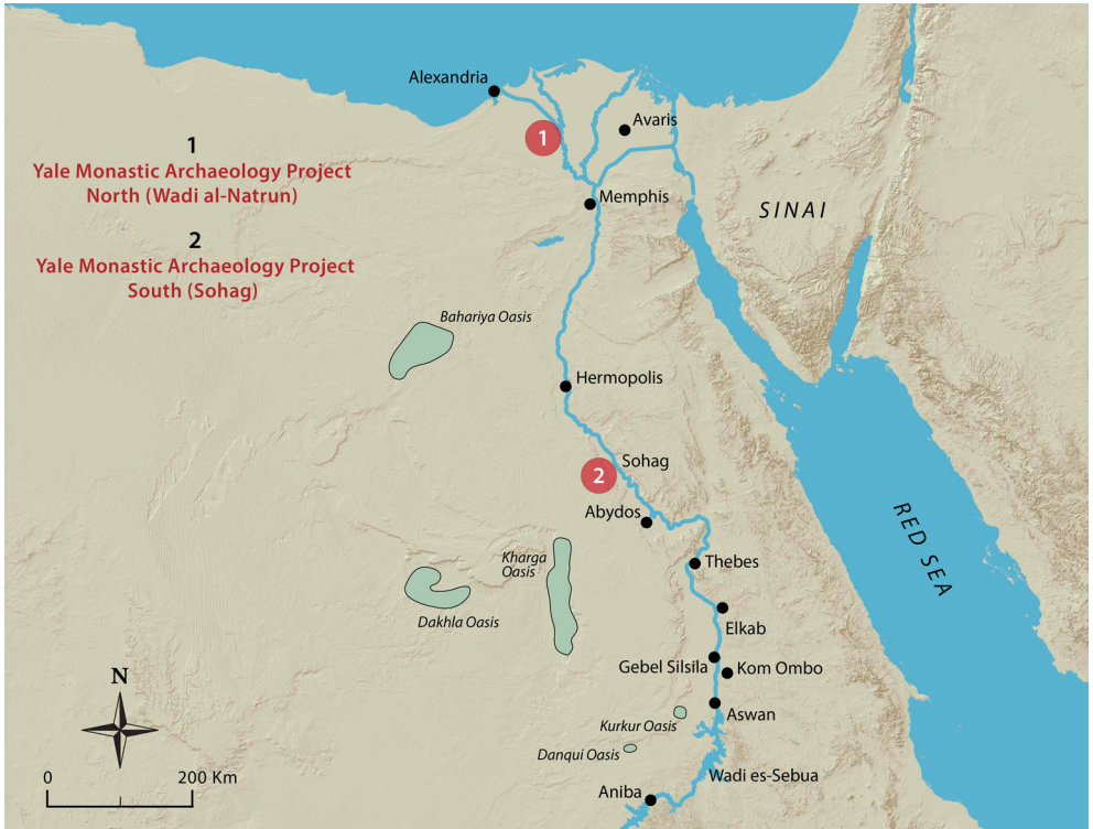
FIGURE 4.1 Map of Egypt, showing the location of the Monastery of the Syrians (Wādī al-Naṭrūn) and the White Monastery (Sohag). Map created by Alberto Urcia for the Yale in Egypt website: < http://egyptology.yale.edu/expeditions/current-expeditions >. Davis for this publication, accessed on 10.04.19; ©STEPHENDAVIS

conversations about cultural heritage, the legacy of colonialism, and the control of manuscript content in the digital age. 1