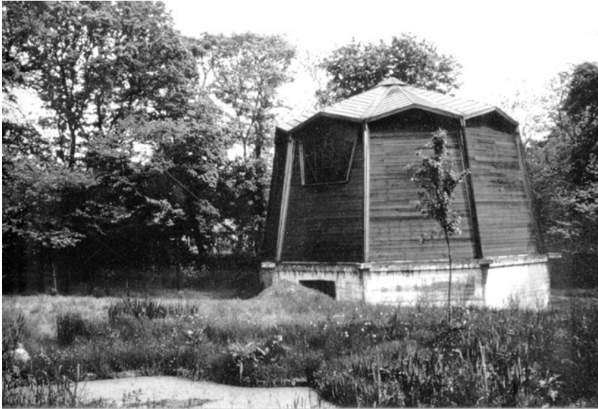
FIGURE 26.2 The Djameechoonatra, Coombe Springs, c. 1965