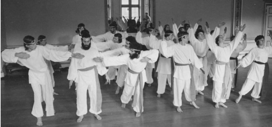
FIGURE 26.1 Enneagram Movement, Sherborne House, 1974