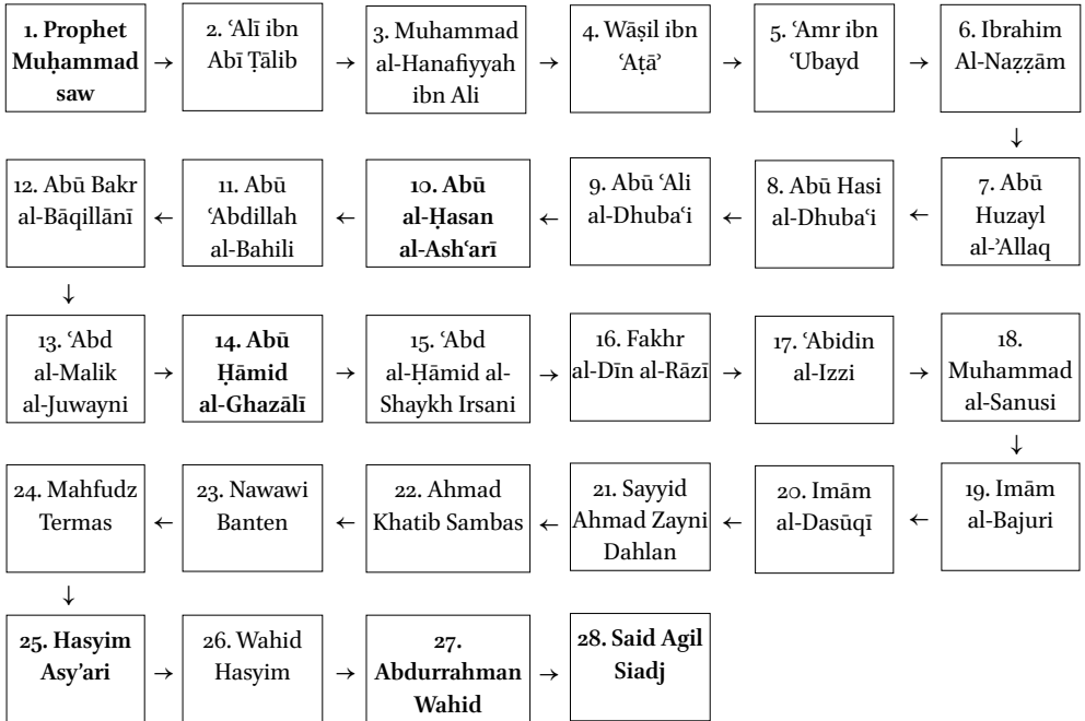
FIGURE 6.2 Sanad of NU's 'Ulamā'

The above example is simply written as a linear form of sanad , where there is only one 'alim or Muslim scholar in each chain. Realistically, however, there are a number of other names in each chain which continue the same chain eye in different levels or generations. For instance, Mbah Hasyim/Hasyim Asy'ari (25) learned and received sanad of knowledge from Mahfudz Termas (24), and at this same level, also from Arsyad al-Banjari, Kholil Bangkalan, 'Abdul Shomad Palembang, and many more. These four 'ulamā' learned and took sanad from Nawawi Banten (23). Similarly, a number of 'ulamā' might be present in each level of the example of sanad above.