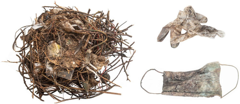
Figure 3. Nest of common coot ( Fulica atra ) partly built with face mask (GW9792-3) and glove (GW9792-4). Nest located at the Beestenmarkt, Leiden, The Netherlands, collected on the 6th of September 2020.

Our observations may have been the first Dutch cases, yet the first reported victim of COVID-19 litter globally, to our knowledge, was an American robin ( Turdus migratorius ; Denisuk, 2020). This bird appears to have died after becoming entangled in a face mask at Chilliwack, BC, Canada, on the 10th of April 2020 (pers. comm. Sandra Denisuk; fig. 4). After that, a young gull ( Larus sp.) was found walking with a face mask tangled around its legs in Chelmsford, Essex, UK (RSPCA Essex South, 2020). It had struggled with the mask for two weeks and its limbs and